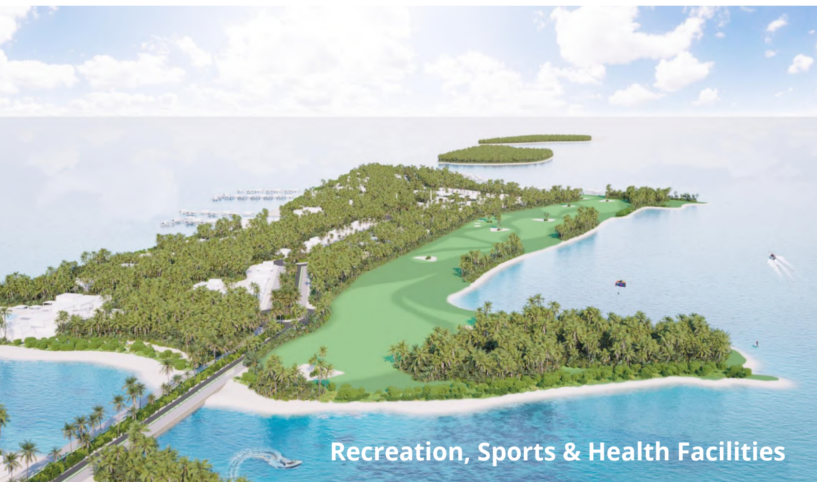
Recreation, Sports & Health Facilities