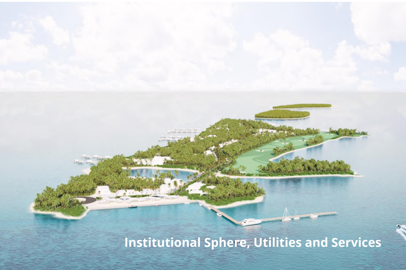
Institutional Sphere, Utilities and Services